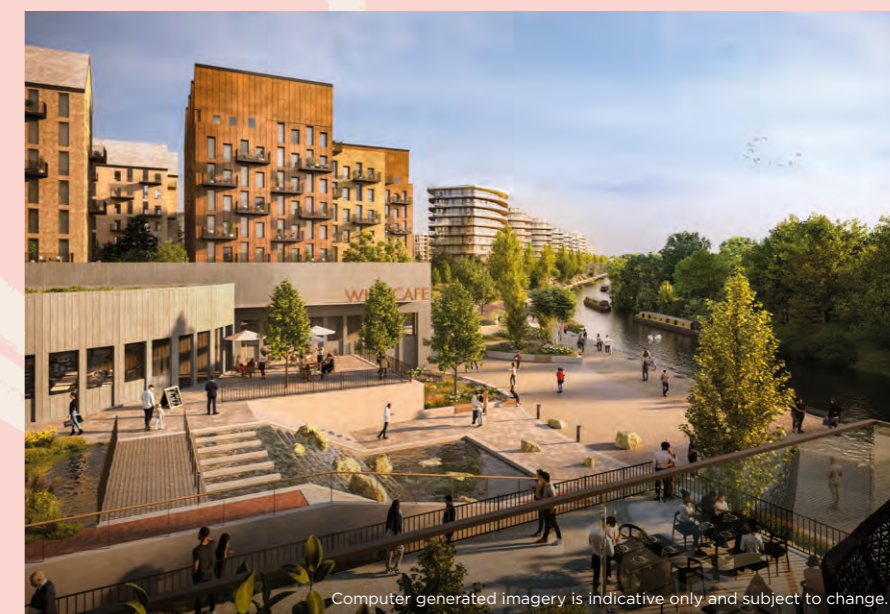
Computer generated imagery is indicative only and subject to change.