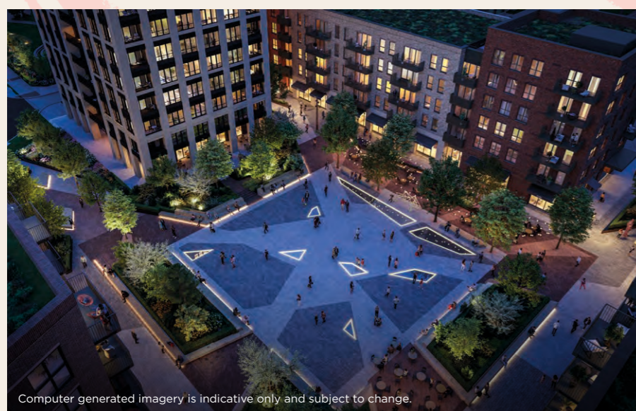
Computer generated imagery is indicative only and subject to change.